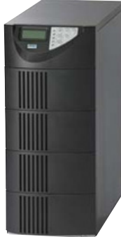
UniStar P Single Phase UPS

The StacoSINE® Active Harmonic Filter detects and corrects all harmonic orders between the 3rd and the 51st, automatically. In sizes from 25 to 200 amps, the StacoSINE® can address any harmonic situation you may encounter.