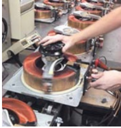
100% of our product is tested before it ships.