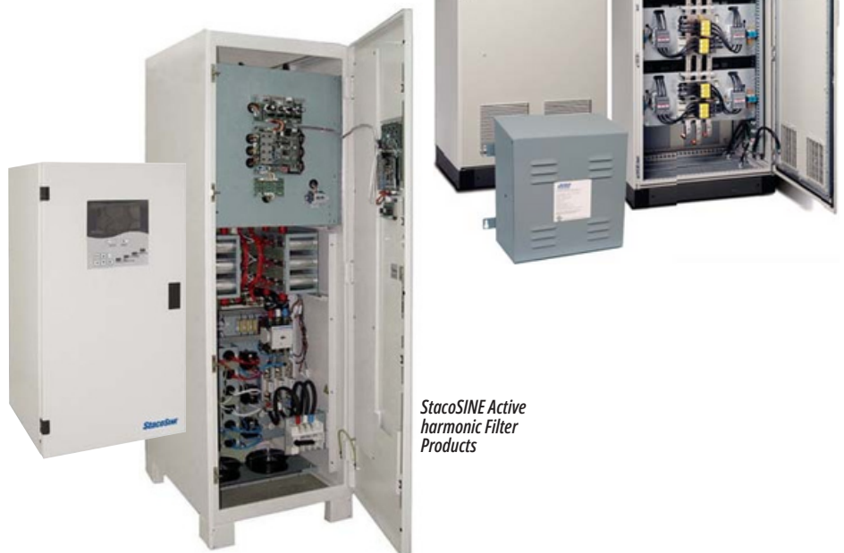
StacoSINE Active harmonic Filter Products