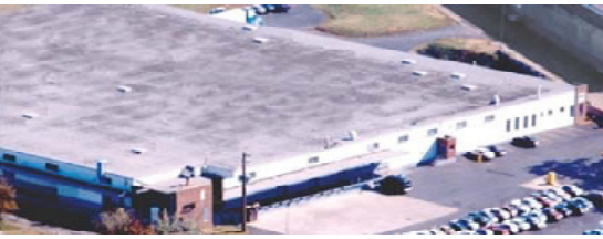
Staco Energy Products Company Headquarters, Dayton, Ohio