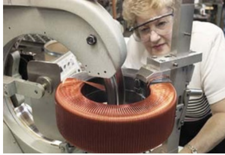
Coil Winding for VT, Test Set, and Voltage Regulator Applications

The Staco Energy Products Company line of variable transformers is the most extensive available, containing over 1,400 part numbers. From simple plug and cord models for bench testing, to complex ganged units, we can provide it.