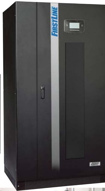
FirstLine P Three Phase UPS