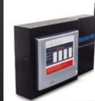
FirstLine BMS Battery Management System