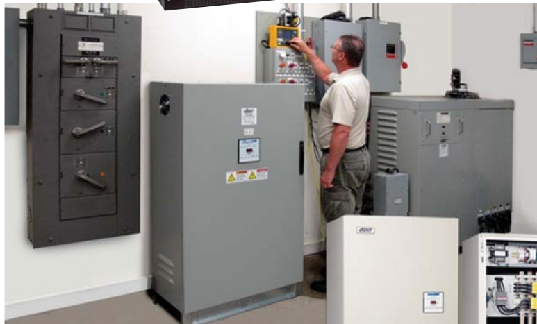
StacoVAR Power Factor Correction Products